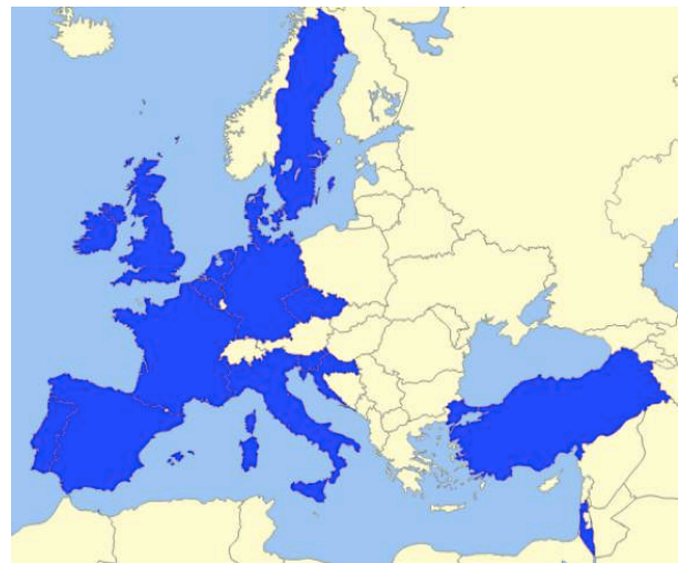
Sixteen ONCA Countries - 2017

To guide and accelerate the national implementation efforts, ENHA and the country delegations developed a set of tools and templates. By sharing resources and good practice, the country delegations work along the same lines, with the liberty to diverge and choose tailored, national solutions. As in national health care systems, one size does not fit all.