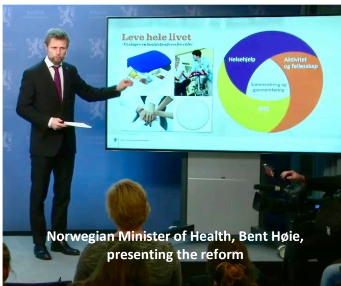
Norwegian Minister of Health, Bent Høie, presenting the reform

The Department of Health is doing the actual work. They have plenty of qualified personnel, experts on health, medicine and nutrition. However, there is not a single person in the department with a kitchen background, who knows how a professional kitchen actually works. Some of the early reform suggestions were quite unrealistic, from a kitchen's point of view. So, we contacted the department, offering our insight on kitchen matters. They welcomed this and have already contacted us a couple of times.